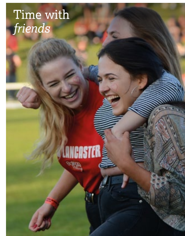
Time with friends