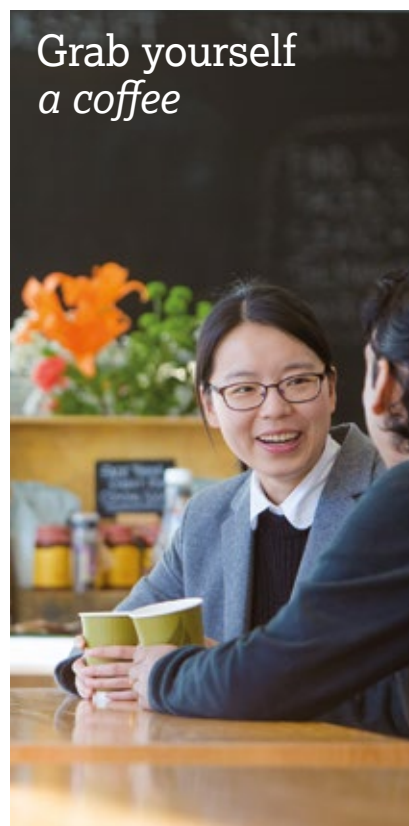
Grab yourself a coffee